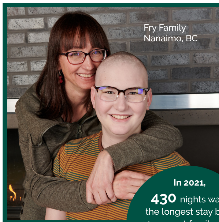
Fry Family Nanaimo, BC

healthy siblings were able to stay close to their brother or sister who was in the hospital